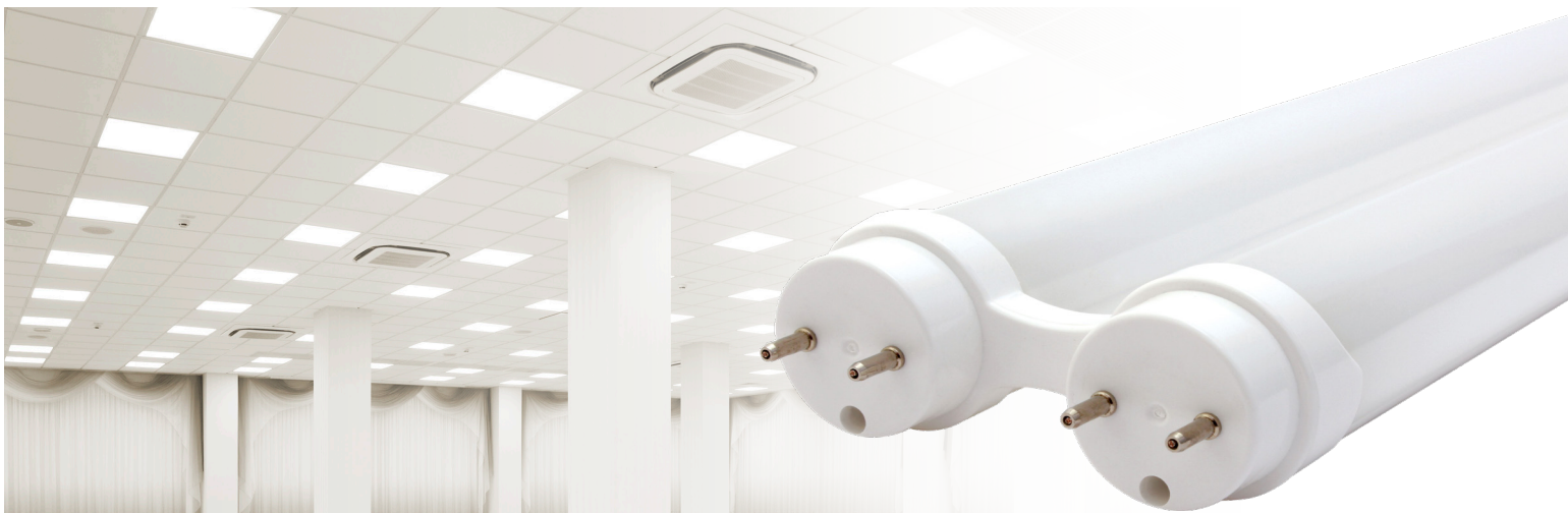
Application illustration only, subject lamps not used in photo.